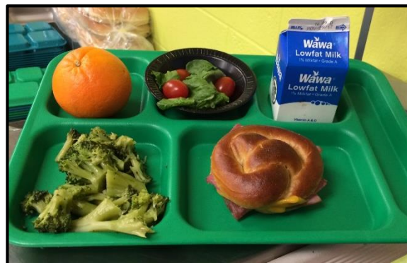
Ham and Cheese on a Pretzel Roll: Feb. 20 th at Elementary Schools and Skyview